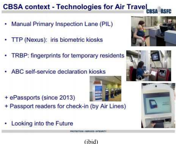
Figure 5. Airport Screening Technologies.

Externalization is the transfer of border management to third parties, in this case foreign nations [15]. Externalization is really a shrewd political move. European leaders very well know they cannot intentionally and openly violate human rights by taking strict measures against refugees and immigrants. They know some Eastern European, Turkish, Arab and African leaders have a record of violating human rights of people, of their subjects and of foreigners. It is no secret and well documented [17, 18]. Hence European leadership made the move to externalization so that these human right violators could harshly take care of the incoming refugees and immigrants fleeing war and persecution. Let us take the case of Sudan. Sudan's Eritrean hunt is notable. Sudan is capturing and deporting Eritreans back to Eritrea which is a ferocious dictatorship [15]. The externalization agreements are not transparent and undemocratic [15]. International law protects these refugees who are fleeing war and persecution [18] and according to Universal Declaration of Human Rights everyone has the right to seek and enjoy asylum in other countries from persecution [19].